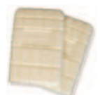
Knee Pads pair