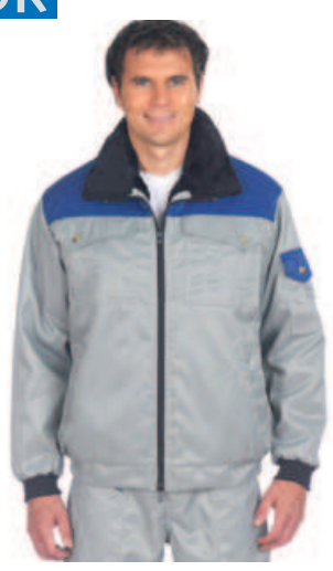
table of sizes see page 4

SIZE COMPATIBILITIES XS = . . . . . 900 S = . . . . . 910 M = . . . . . 920 L = . . . . . 930 XL = . . . . . 940 XXL = . . . . . 950